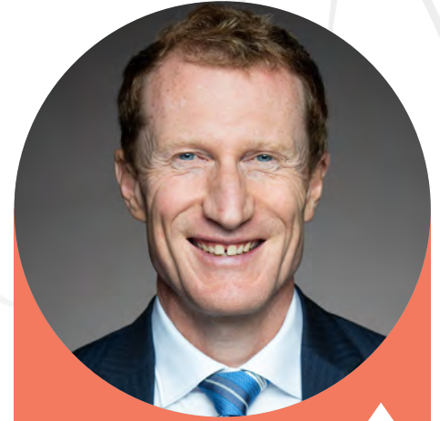
THE HONOURABLE MARC MILLER, M.P., MINISTER OF IMMIGRATION, REFUGEES AND CITIZENSHIP CANADA

IRCC will continue to work with Francophone communities and organizations such as the AMBM Group to strengthen this initiative so that French-