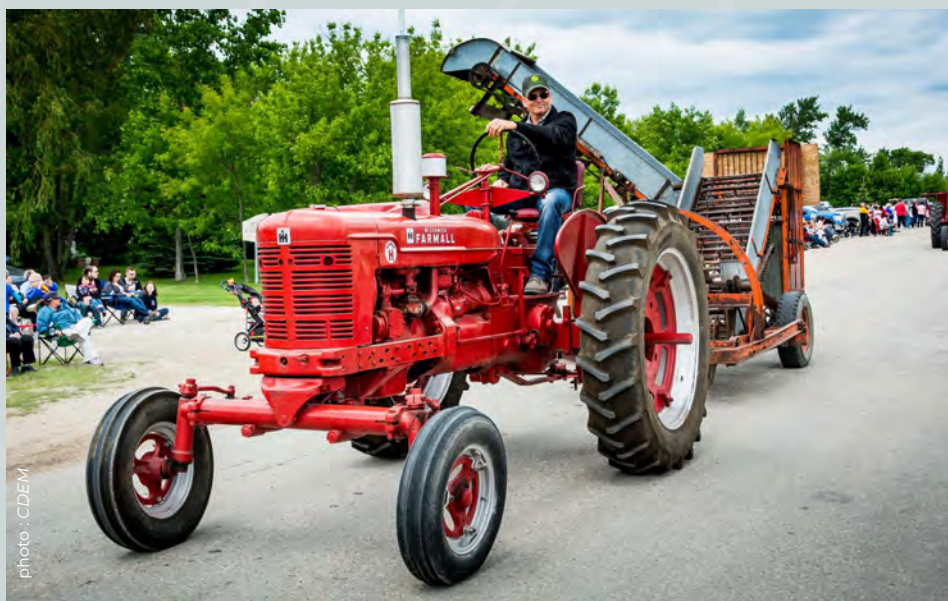
The Montcalm Heritage Festival in Saint-Joseph, an annual event in June.