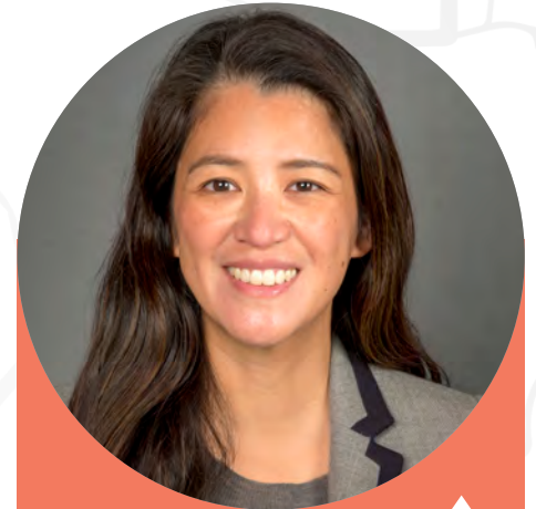
THE HONOURABLE MALAYA MARCELINO, MANITOBA MINISTER OF LABOUR AND IMMIGRATION

These stakeholders include the three organizations that make up the AMBM Group: the Association of Manitoba Bilingual Municipalities (AMBM), the Economic Development Council for Manitoba Bilingual Municipalities (CDEM) and Eco-West Canada (EWC). We congratulate them on their leadership in Francophone and bilingual economic immigration, particularly for the creation and implementation of the Strategy to Support Economic Immigration in Manitoba's Bilingual Municipalities .